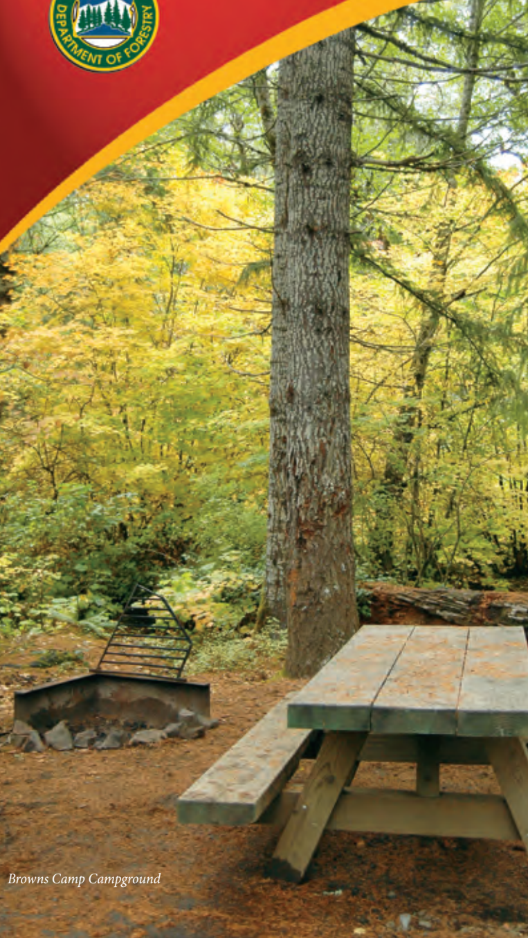
Browns Camp Campground

Explore a Coast Range forest, get closer to nature or discover the history of the legendary Tillamook Burn. Grab your gear and bring your family and friends to the Tillamook State Forest – it's all here. The forest is less than an hour drive from Portland or from Highway 101 on the coast.