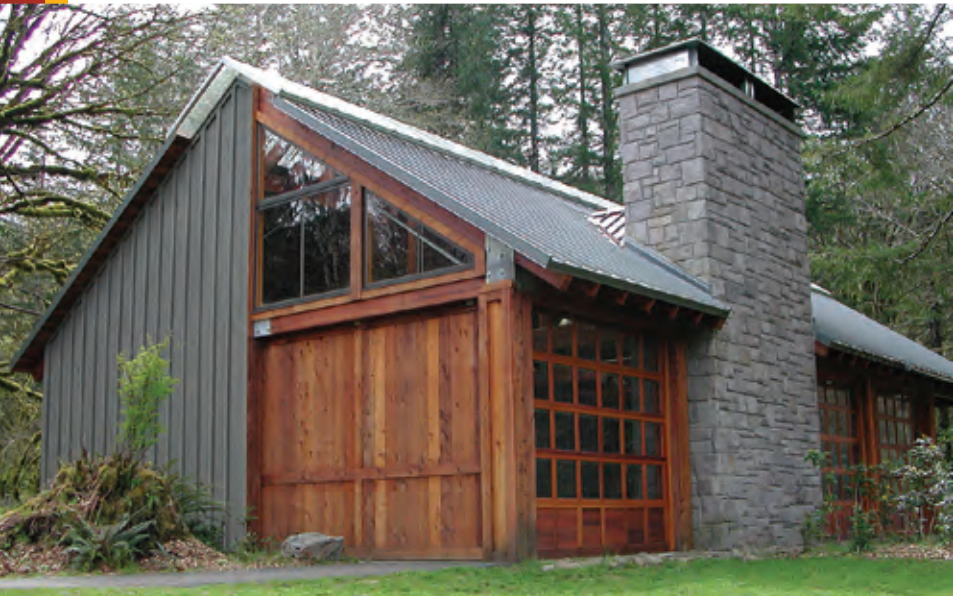
Smith Homestead Forest Learning Shelter