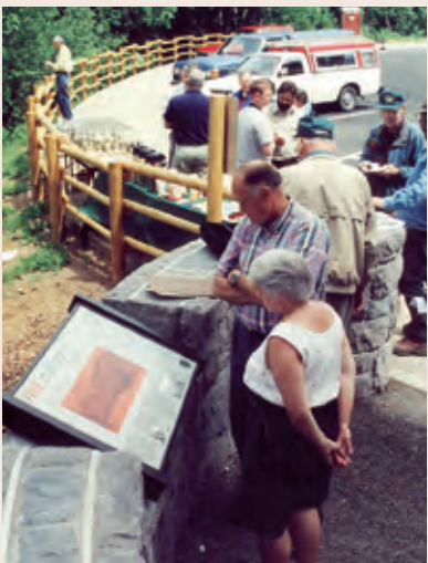
Gales Creek Overlook

Day-use areas, highway waysides and scenic overlooks are located in campgrounds or along highways through the forest. They are free and offer shaded picnic sites, easy trails and most are close to a stream. The Smith Homestead and Jones Creek Day-Use areas are popular facilities located near the Wilson River off Highway 6 and have plenty of room for parking. The Forest Learning Shelter at the Smith Homestead offers a large rustic shelter that can be rented for private events.