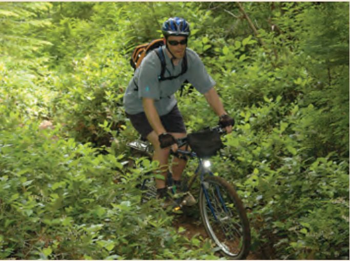
Gravelle Brothers Trail

Enjoy a variety of over 60 miles of non-motorized trails on the Tillamook State Forest. Whether you prefer hiking, mountain biking or horseback riding trails, there is a trail here for you. Take an easy hike on the Peninsula Trail in the spring for a wildflower show. Pedal your mountain bike on the Historic Hiking Trail for a rocking good ride. If you're looking for a steep climb to a mountain-top with inspiring views, tackle the Kings Mountain Trail. Some trails may be closed seasonally to protect them from damage. Remember to "Share the Trail" and abide by posted signs that display the type of use allowed. A series of detailed trail guides are available at district offices, the Tillamook Forest Center and on our websites.