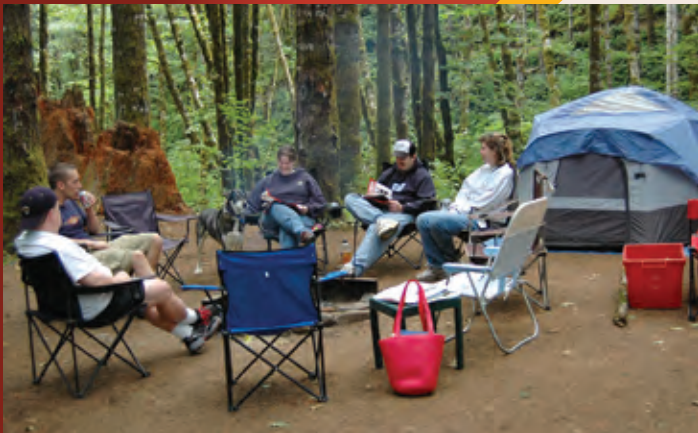
Gales Creek Campground