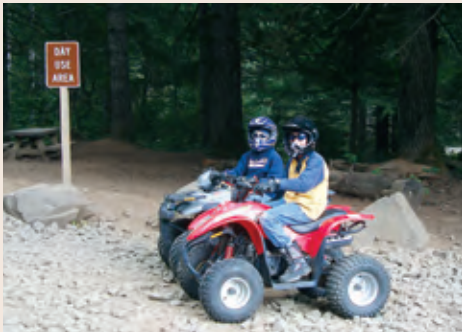
Browns Camp Day-Use Area

If you like a more challenging ride, try Jordan Creek Staging Area. The Diamond Mill area offers difficult single-track motorcycle trails. Pick up a Tillamook State Forest OHV Guide for more details and a map of the designated OHV trail system.